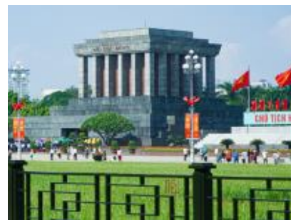
Ho Chi Minh Museum