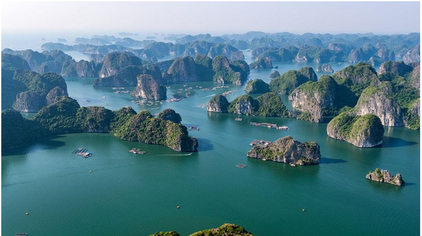
Ha Long Bay

Note: Cruise's Itinerary could be changed without prior notice and based on which cruise clients choose