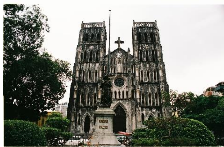
St. Joseph's Cathedral, Hanoi